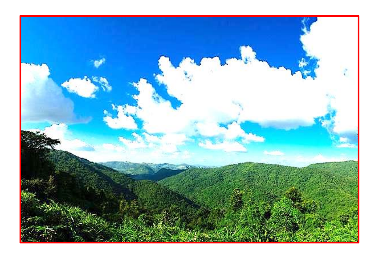
Day 3 2<sup>nd</sup> stage, Pak Chong – Kabin Buri | 102 km | 880 m ascent | one gradient then wavy

Today we cross the Khao Yai National Park. The evergreen foliage of the Park's forest creates the natural border between the plains of central Thailand and the high plateau of the Isaan. The Khao Yai National Park has been awarded with the UNESCO World Culture Heritage Status as a unique nature reserve. B | L incl.